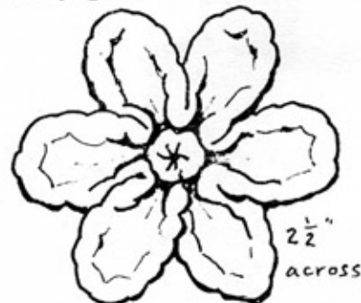
DAISY make 1

Make one daisy and two leaves. Sew onto top of case as shown in the photo on page 1.